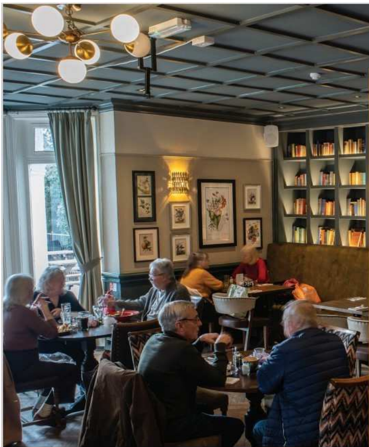
THE HIGHTOWN PUB & KITCHEN, LOWER ALT ROAD, L38 OBA

As that famous advertising slogan tells us: 'every little helps'.