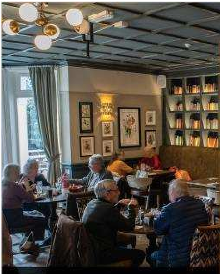
THE HIGHTOWN PUB & KITCHEN, LOWER ALT ROAD, L38 0BA

As that famous advertising slogan tells us: 'every little helps'.